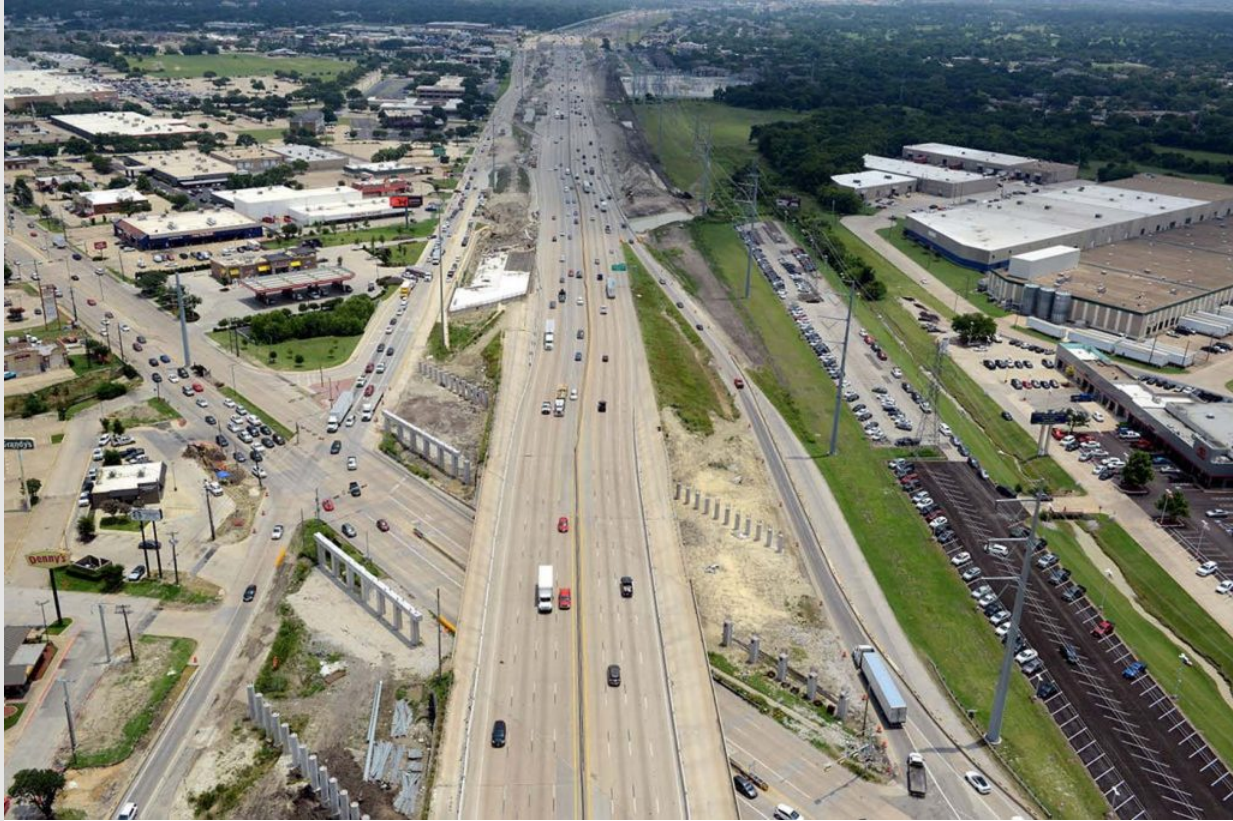
Here's an aerial view of the Northwest Highway intersection along Interstate 635.